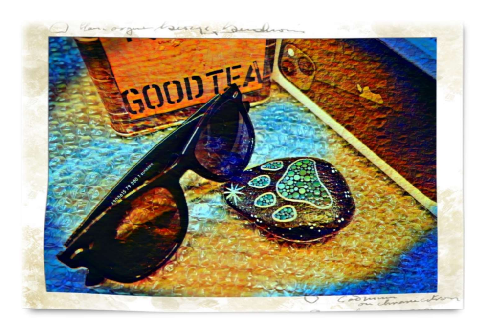
Day2 - If you could have only five things for the rest of your life, what would it be?