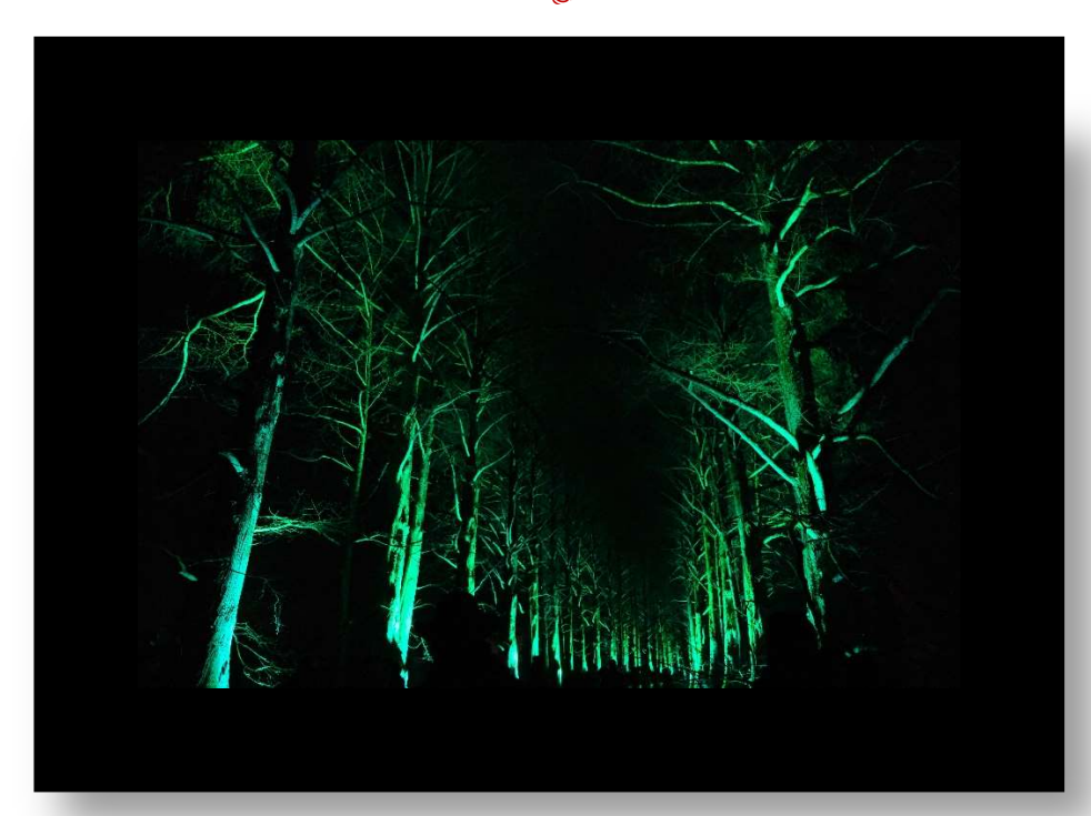
Day 12 - Five Things you fear the most