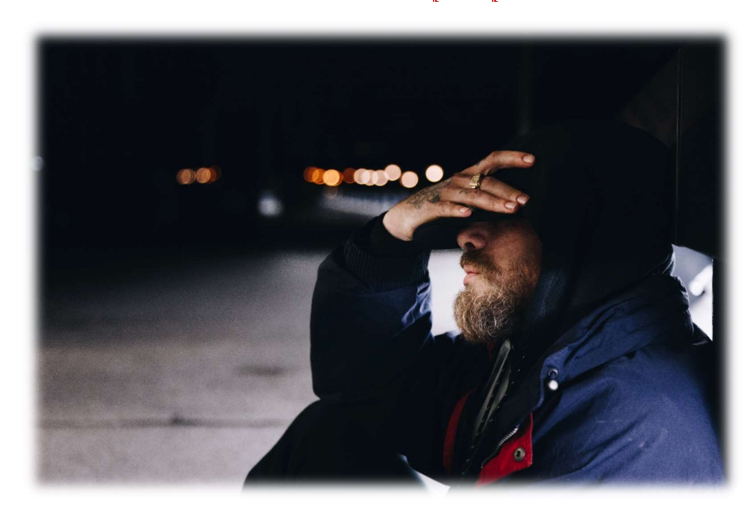
Day 23 - Your deepest pain?