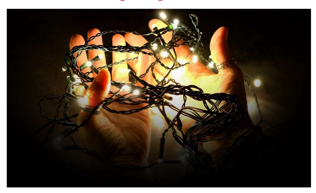
Day 17 - Five things you gave somebody recently