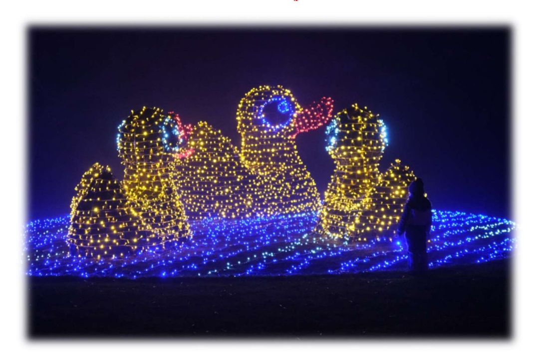
Day 7 - What is your greatest desire? What are your steps toward it?