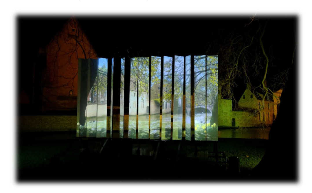
Day 21 - Five mayor transformations?