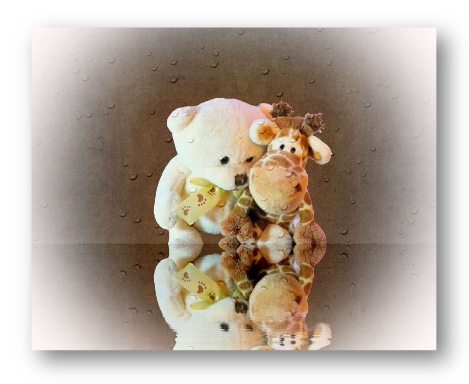
Day 20 - Five People who's live is affected by you?