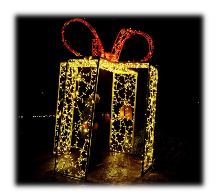
Day 14 - Five Dreams that haven't come true yet