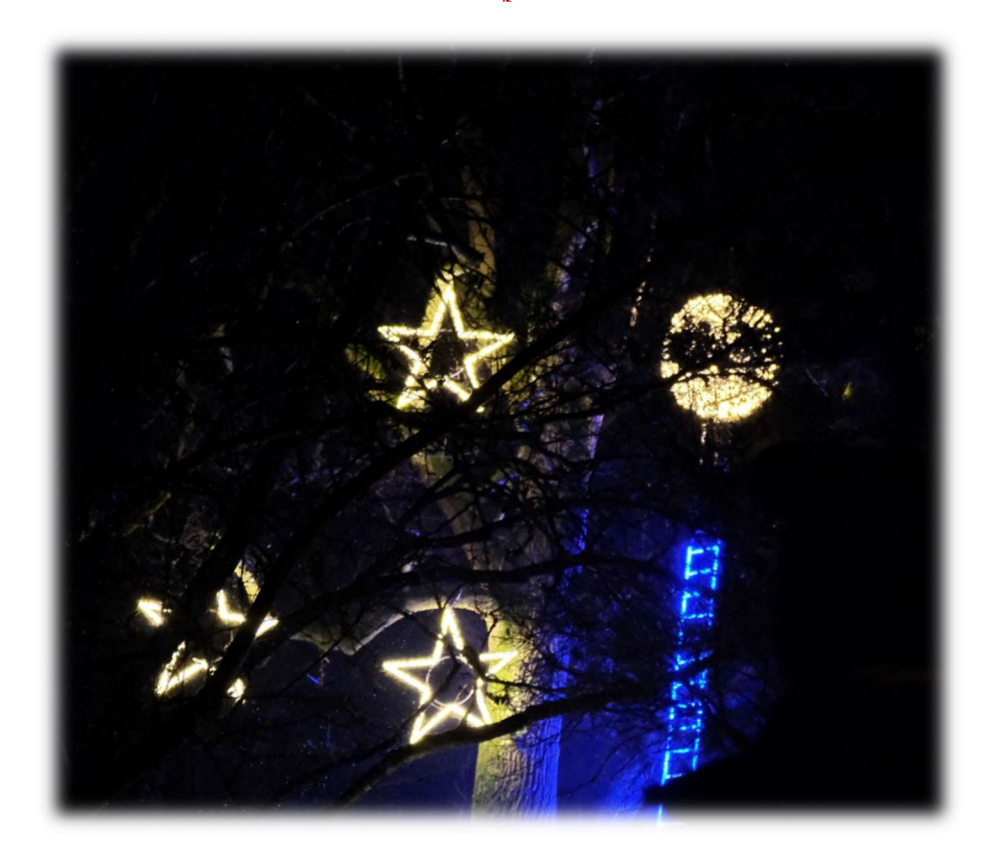
Day 13 - What is your place in the universe?