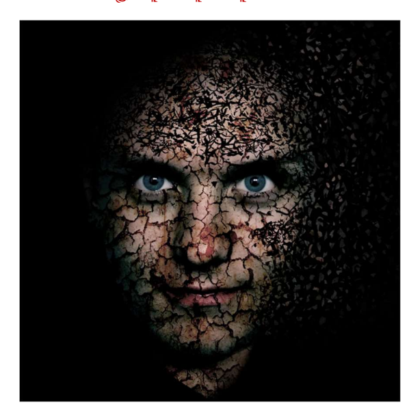
Day 18 - Five things people pushes away from you?