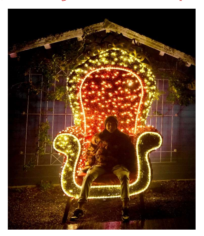
Day 24 - Five things which are very unique on you