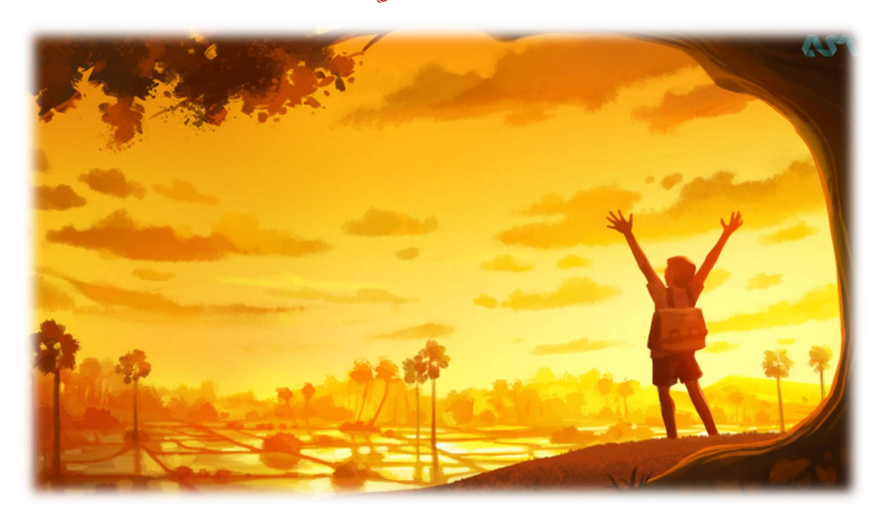
{\sf Day\ 22-Five\ things\ that\ makes\ you\ feel\ alive?}