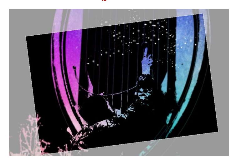
Day 5 - What is your greatest motivation in life?