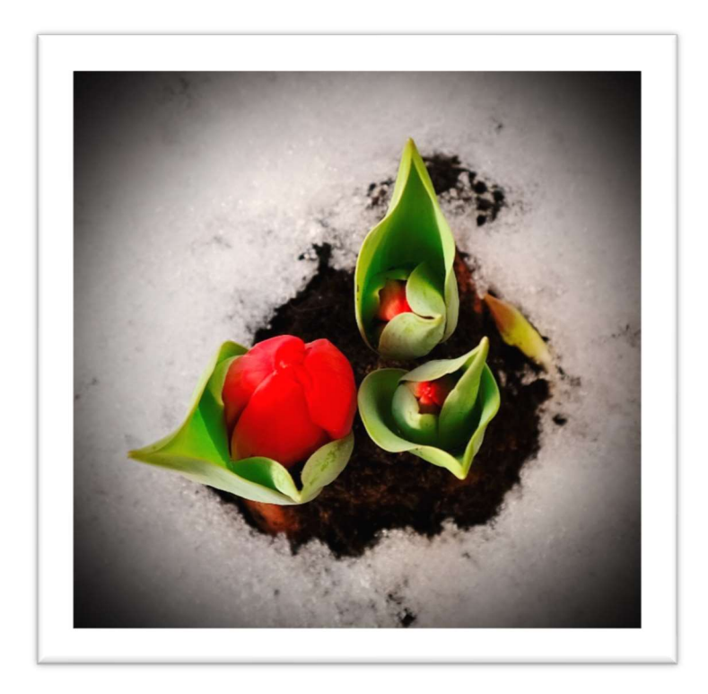
Day 10 - Five Things you continued doing even against all odds

THE WORLD IS FULL OF MAGIC THINGS PATIENTLY WAITING FOR OUR SENSES