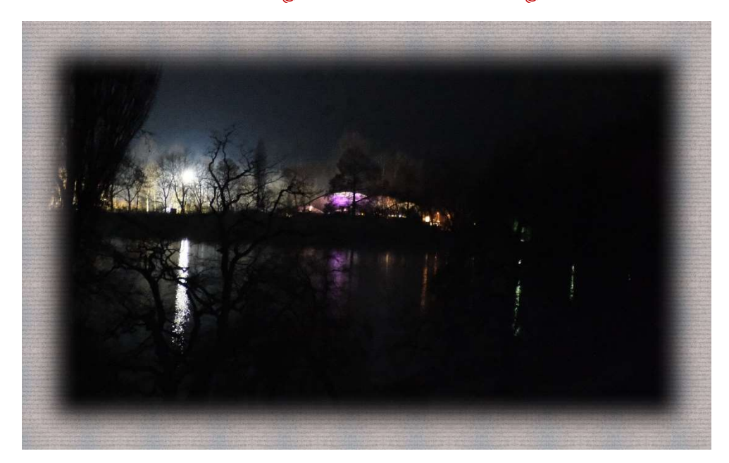
Day 9 - Five Things that are troubling you most